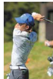
William C. Campbell Scholarship