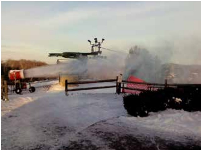
Making snow for the slopes at Oglebay Resort!