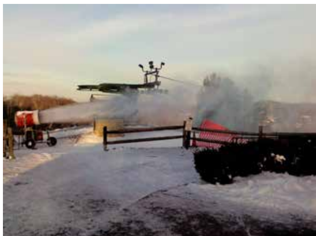
Making snow for the slopes at Oglebay Resort!