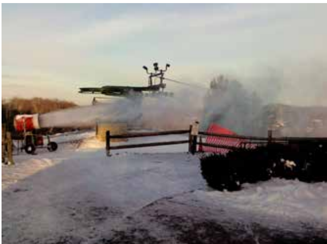
Making snow for the slopes at Oglebay Resort!